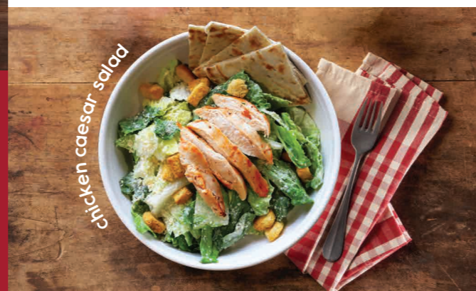
chicken caesar salad

house salad 12.99 | 760 CAL romaine lettuce, cucumber, tomatoes, shredded cheddar cheese, croutons, red onions with choice of salad dressing