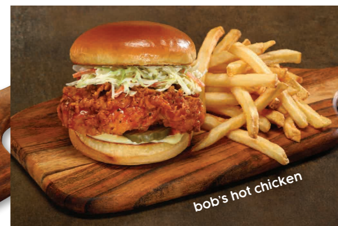
bob's hot chicken