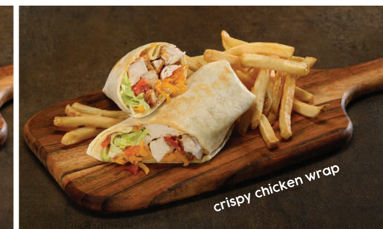
crispy chicken wrap