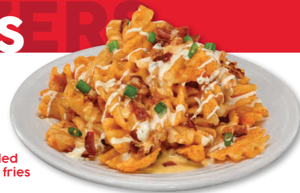
loaded waffle fries

bavarian pretzel 13.99 | 750 CAL milwaukee pretzel company's bavarian style pretzel