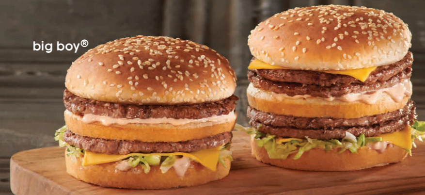
super big boy®

big boy®* 11.99 | 650 CAL american cheese, shredded lettuce and our famous big boy sauce on a sesame seed bun