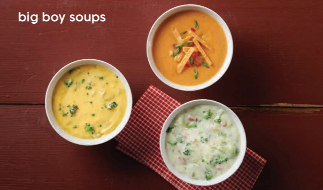
big boy soups

loaded big boy chili with chopped onion & shredded cheddar cup 6.99 | 310 CAL, bowl 7.99 | 380 CAL