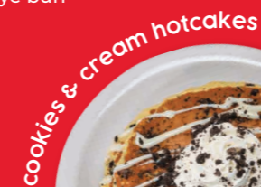
cookies & cream hotcakes

brawny lad* 12.99 | 545 CAL topped with butter and a slice of onion on a toasted rye bun