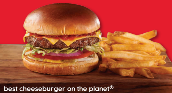
best cheeseburger on the planet®